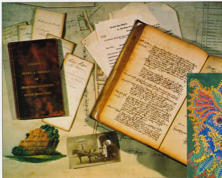
Books and documents from the archives.