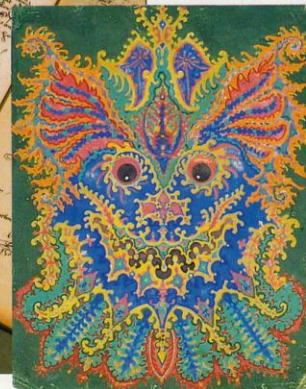
Louis Wain, Cat Pattern.

Some 20 years later a greatly expanded collection is maintained by the Bethlem Art and History Collections trust. For more information, go to: